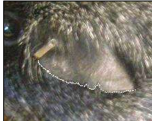
Bitten, ragged Ear A Fault