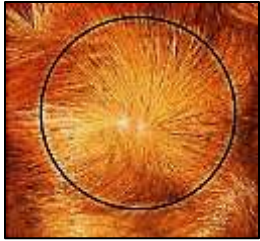
Double Rosette (Fault in Aby's)

Note: there are many more faults and disqualifications for cavies than those illustrated here. Refer to the Standard of Perfection for complete lists of general and breed-specific faults and disqualifications.