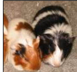
TSW's must show a patch of all 3 colors at least the size of a 50-cent piece. These do not.