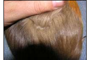
Undercolor fading near the skin. A fault.

Broken Color cavies may be 2 or 3 colors, but must show a patch at least the size of a 50 cent piece of each color. A pattern resembling a checkerboard is ideal. The photo on the left shows intermingling of two colors on a broken or which is a fault. The photo on the right shows excellent "clean", clear-cut patching, but poor distribution of color on this side—the amount of white on the cavy is unbalanced.