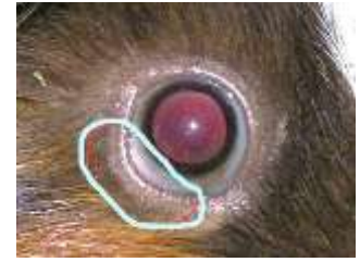
Pea Eye – DQ (Lump in lower lid)