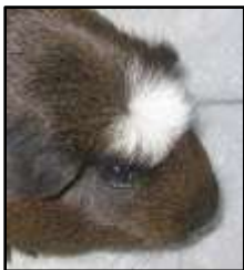
White Crested missing over 1/8 crest -- DQ