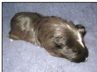
Foreign colored (white) spot A disqualification